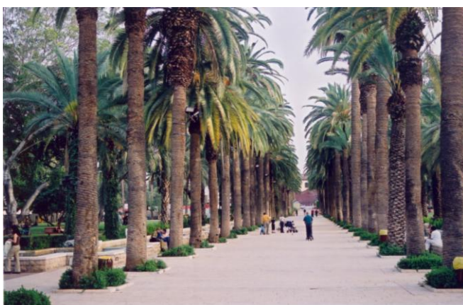
גן המושבה היום