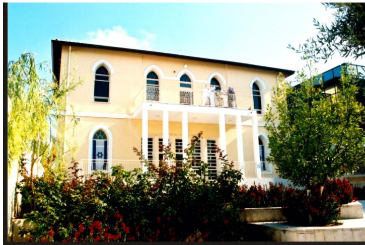
בית יד לבנים משופץ