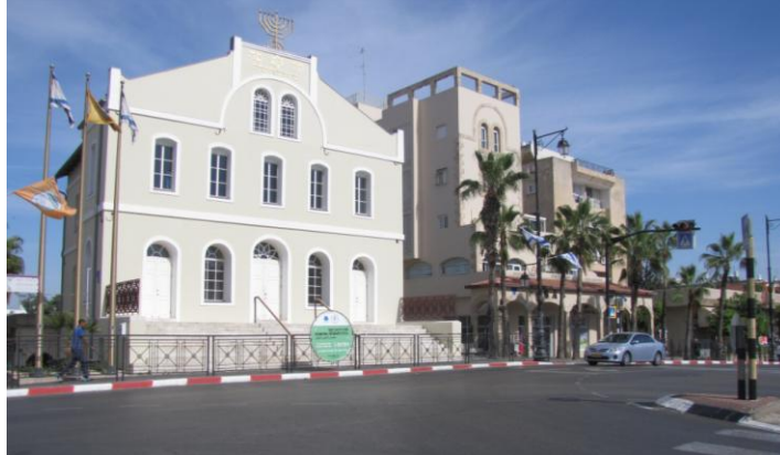
בית הכנסת לאהר השיפוץ

Our program was divided into two parts: Renewal of the museum and presentation strategies within the historic city.