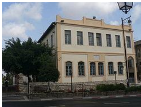
מבנה בית הספר העברי הראשון, נוסד בשנת 1887