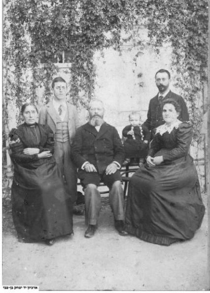
איכיליי ויילקין 1880