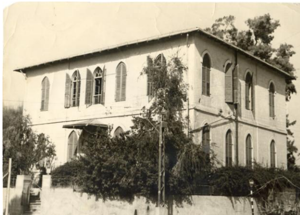
בית יד לבנים לפני השיפוץ