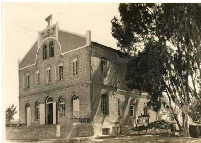
בית הכנסת לפני השיפוץ