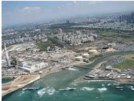
ראשון לציון היום - מבט מעל

Rishon LeTzion (literally “the first of Zion”) is the fourth largest city in Israel. It's in the center of the country, 16 kilometers – about a half-hour drive – from Tel Aviv.