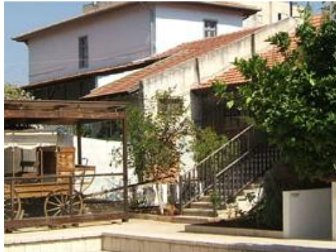
החצר ואחד המבנים