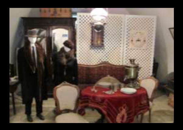
ROOM OF EUROPEAN STYLE