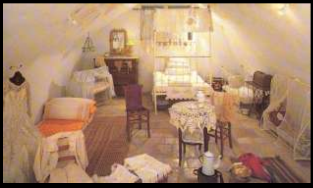
ROOM OF WOMEN IN LABOR