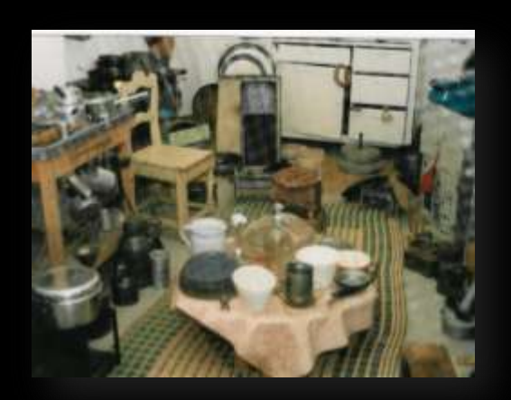
The kitchen before redesign