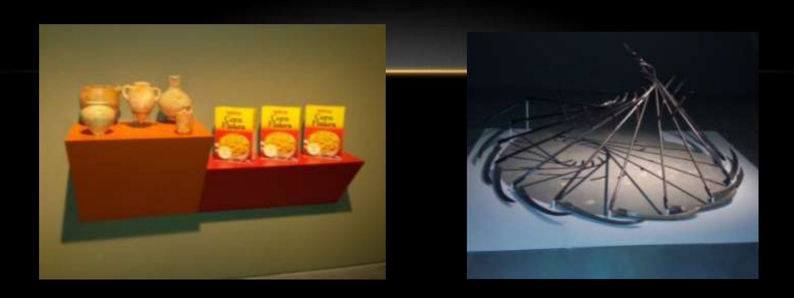
Exhibit in Israel museum Jerusalem