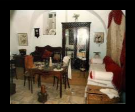
ROOM OF ORIENTAL STYLE