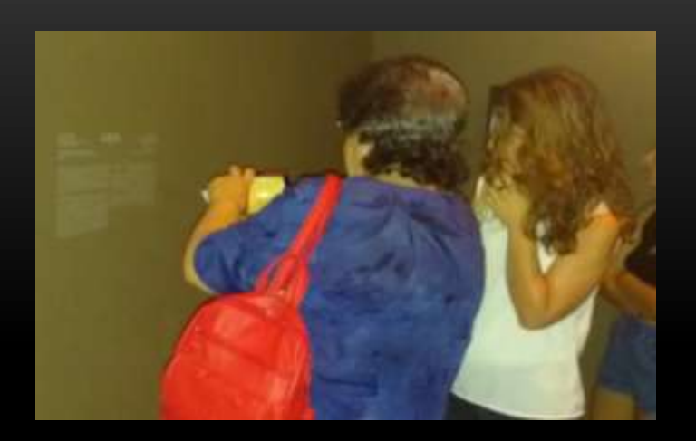
Today, the way to relate to an exhibit or lecture is through photography